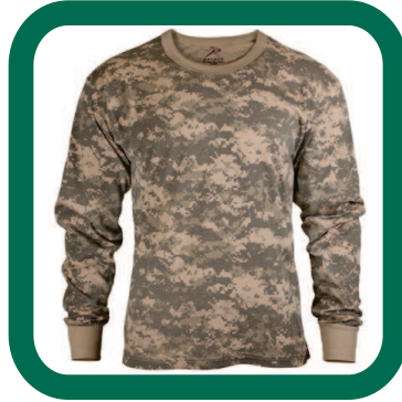
Digital Camouflage Long Sleeve T-shirt