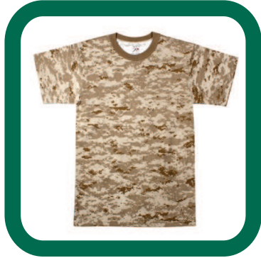
Digital Camouflage T-shirt